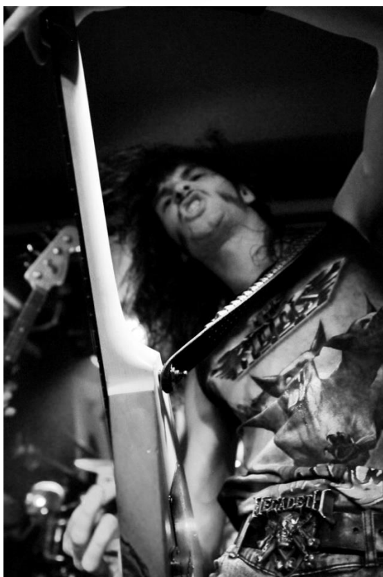
Evil Invaders – Hard Rock Hideout (JJ Koczan)